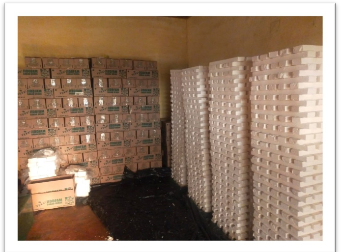
Soap drying before it is packaged into the used cartons