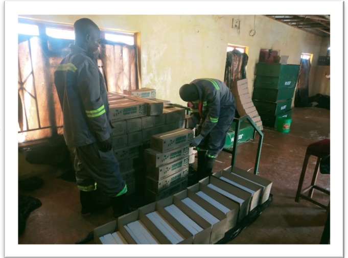
Packaging the soap

Freddy was an exceptionally long-lived, powerful, and deadly storm that traversed the southern Indian Ocean for more than five weeks in February and March. It was the longest-lasting and most intense tropical cyclone ever recorded worldwide. Malawi was hardest hit. Many group members are still sleeping on a church floor.