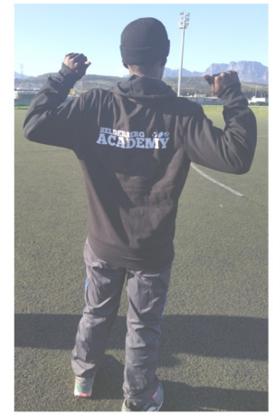
Academy logo on coach's uniform