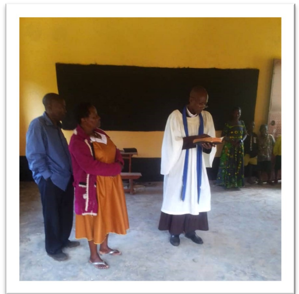
Blessing of the donors and the second classroom

So, in the summer of 2022, we launched an appeal to raise £4,400 by the end of September 2022, to enable them to build the first classroom in time for their new school year. To raise even that amount in such a short time was a step of faith for us. But God was good and through the generosity of our supporters, just over £5,000 was raised, which enabled them not only to complete the first classroom but also, in faith, to lay the foundations for the second one.